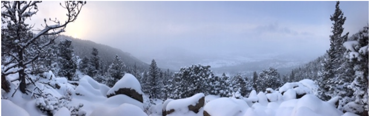
View from the Kruger Rock trail from Ranger Louie.

Staff was busy with the first major snowfall of the year. With limited staffing, it takes everyone jumping in to keep our properties open for the public to enjoy!