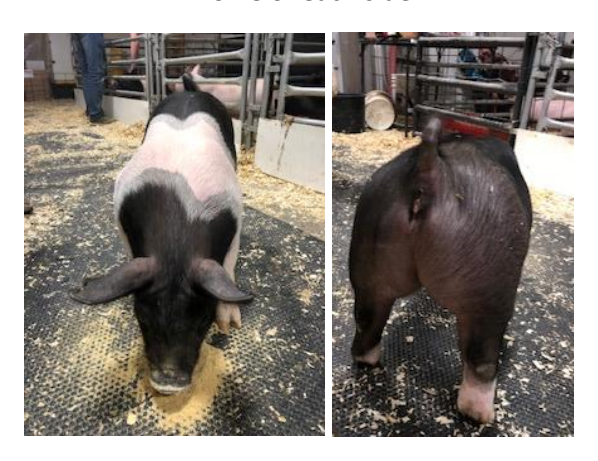
Front and rear view