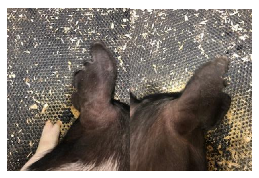
Pictures that show how the hog is notched. Hog in the picture is 6-7 .

Right ear of the hog represents the Litter Number (in the hog pictures it is out of the Sixth Litter ). Left ear of the hog represents the birth order (in the hog pictured, it is Seventh in the Birth Order ).