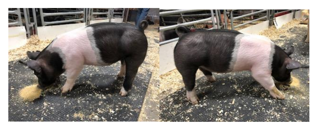
Profile of each side