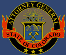
Phil Weiser Colorado Attorney General