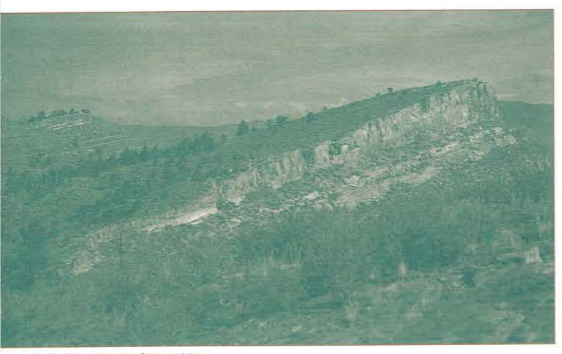
Hogbacks accentuate the transition from the high plains to the foothills

The Open Lands Program works only with willing sellers. That is a condition stipulated in the Help Preserve Open Spaces initiative. We consider landowners to be partners in this program and all partnership relationships must be cooperative. The Larimer County Open Lands Program strives to achieve "win-win" solutions. Purchases must be fair for the landowner and fair for the Larimer County taxpayers.