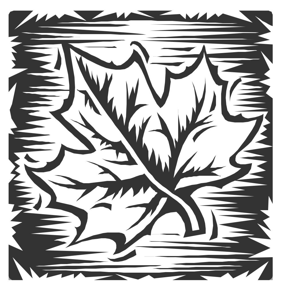
First Edition, November 2000