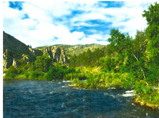
Gateway Natural Area - Poudre River