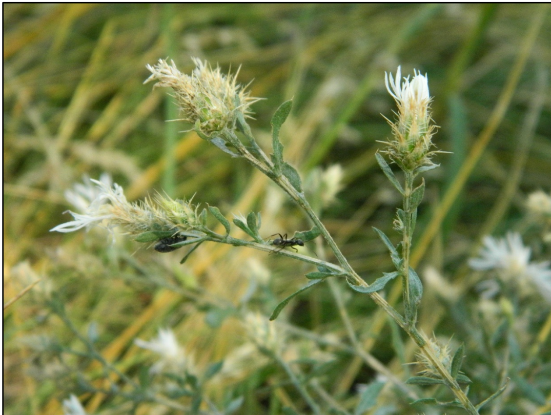
Diffuse Knapweed