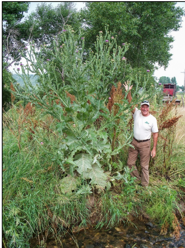
Scotch Thistle