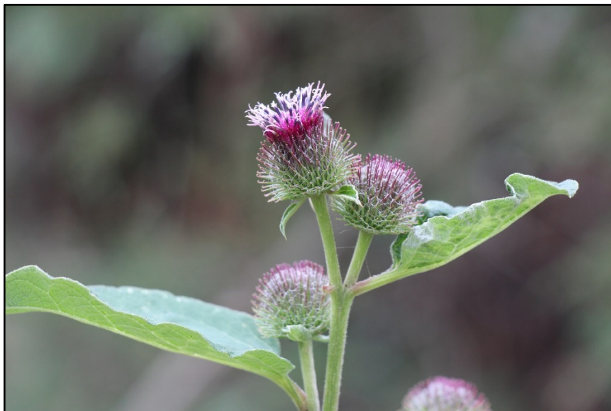
Common Burdock