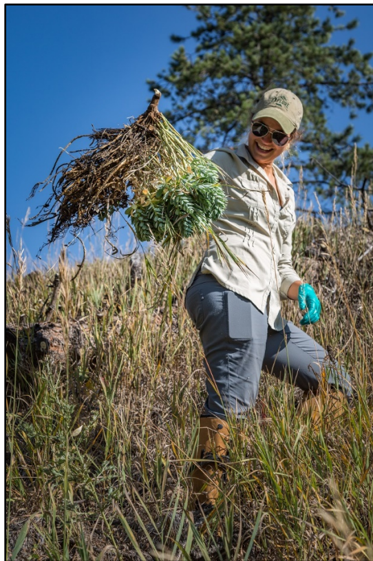
Myrtle Spurge © Jeanie Sumrall-Ajero