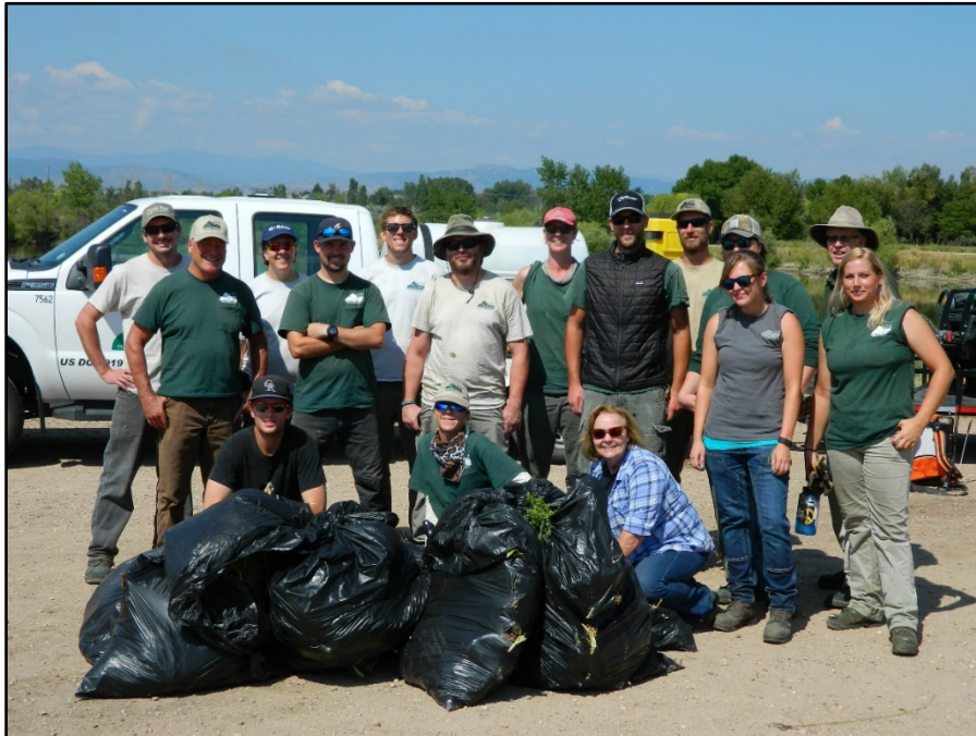
Larimer County Land Stewardship Program Staff

For more information regarding noxious weed management or Larimer County Weed District services, please visit www.larimer.org/weeds or call (970) 498-5768.