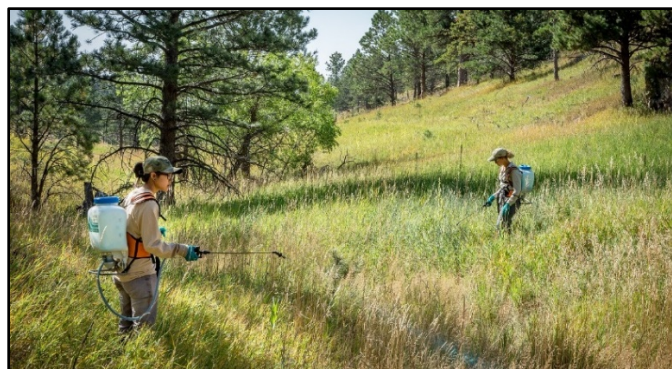
Horsetooth Mountain Open Space

*There is a federal lands exemption to the CNWA. Larimer County does not have noxious weed enforcement responsibility on federal lands within the unincorporated county.