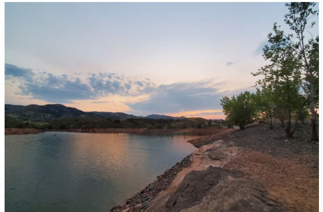
Water levels at Horsetooth Reservoir have lowered this summer in anticipation of HOP.

An important infrastructure maintenance project (Horsetooth Outlet Project or HOP) slated to repair and upgrade Soldier Canyon Dam at Horsetooth Reservoir is being completed by Northern Water and the Bureau of Reclamation this fall. To accomplish this work, water levels in the reservoir have lowered to levels not seen in several years. Maintenance will occur from October through November 2020. Following the completion of the work, inflows will resume to the reservoir with the anticipation of normal operations in 2021. This outlet delivers water to over 200,000 businesses and residents in Fort Collins and surrounding areas. Mandatory water restrictions on lawn watering and other outdoor water uses have been issued to avoid a water shortage due to ongoing severe drought, the Cameron Peak fire, and the infrastructure repairs.