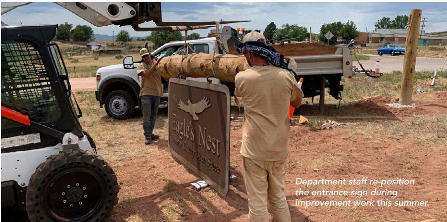
Department staff re-position the entrance sign during improvement work this summer.

Long-awaited improvements flew to the finish this summer at Eagle's Nest Open Space. Staff improved visibility of the main entrance sign by shifting its orientation and built a new sign display for the trailhead, which was rotting and falling apart. Staff also worked to get water well permits from the state for two livestock watering areas and redeveloped the well to meet industry standards. A solar panel was installed to work in conjunction with the well. New fencing was also installed around the water wells to protect sensitive riparian areas from livestock damage. Each of these improvements work together to improve our visitors' experience at the open space while protecting the resource and the agricultural heritage for the future.