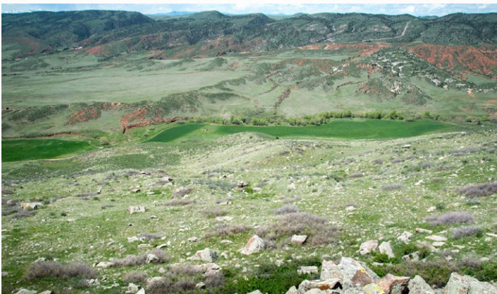
Hawk Canyon Ranch.

Larimer County finalized the purchase of the 1,091-acre Hawk Canyon Ranch, which will provide an over two-mile buffer and scenic backdrop to Red Mountain Open Space (RMOS). Managed by Larimer County as part of RMOS, the property is a significant addition due to its high ecological and scenic values. The acquisition includes Larimer County's $3.5 million dollar fee purchase and conveyance of a conservation easement on the land to the City of Fort Collins. This priority project is one of four ranches recently identified for conservation in the Laramie Foothills area and supported through a Great Outdoors Colorado (GOCO) Open Space grant awarded this June.