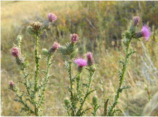
Plumeless thistle, a new invasive weed detected in Larimer County.