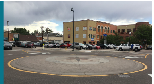
TRAFFIC CALMING CIRCLE