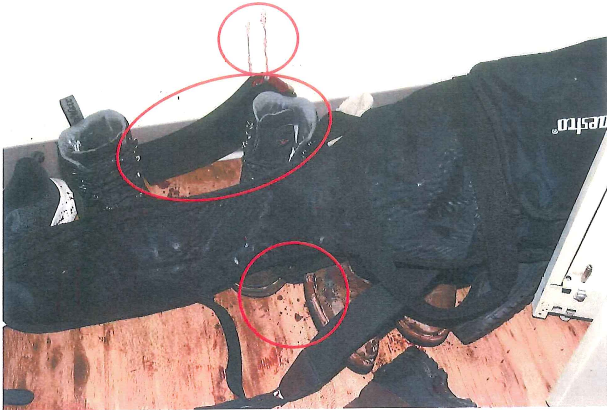
(Inside bedroom closet – blood drops and shotgun magazine circled in red.)

his approach. There was a loaded .45 caliber pistol inside the closet on a shelf, which was also easily accessible.