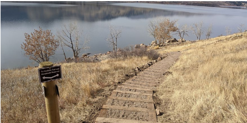
A safer, more sustainable route now exists from Upper Sunrise parking area to Foothills Trail and Horsetooth Reservoir shoreline.

In October, Larimer County Department of Natural Resources (LCDNR) trail staff built 108 steps from the Upper Sunrise parking area at Horsetooth Reservoir down to the Foothills Trail and shoreline. Over fifteen tons of material was moved by wheelbarrows and buckets to fill each step and today, a safer, more sustainable route is in place. In addition, the over 2,400 square feet of spider-webbing social trails that previously existed were restored back to native vegetation.