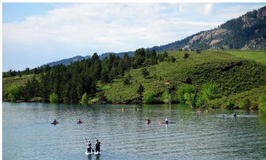
Paddlers enjoy Satanka Cove on a sunny summer day at Horsetooth Reservoir.

At the close of 2021, LCDNR released a community feedback report and 2022 plans for managing high visitation and recreation use at Horsetooth Reservoir. Satanka Bay cove will remain open as a mixed recreation-use zone (allowing both motorized and non-motorized boating) during the low recreation season (September to May) and will convert to a non-motorized use zone (paddlecraft only) during the high recreation season (May to September). Additional monitoring of boat launches, visitor use, and parking will continue in 2022. Heightened education for paddlecraft boaters will occur with the help of volunteers to expand outreach on the water.