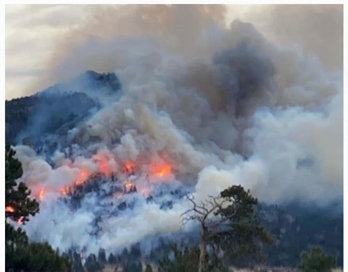
Kruger Rock Fire.

On the morning of November 16, numerous agencies responded to the Kruger Rock Fire, southeast of Estes Park. LCDNR ranger staff assisted with evacuations of nearby residents and supported partner agencies during the week of the fire. A veteran pilot responding to the fire for "slurry" drops died in a single engine air tanker crash within Hermit Park Open Space (HPOS). The plane was located, and the body of the pilot recovered. In total, the Kruger Rock Fire burned 147 acres on lands adjacent to HPOS. Currently, remediation efforts are underway at HPOS at the site of the airplane crash. Approximately 19 cubic yards of forest litter and duff were contaminated by spilled diesel fuel, and recovery crews plan to employ a bacteria to naturally breakdown the harmful hydrocarbons in the soil.