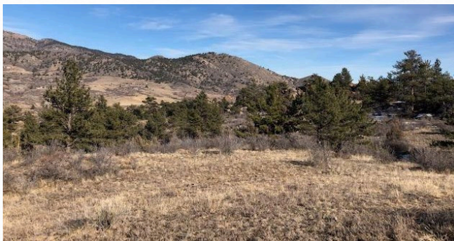
Rockin K Diamond Ranch CE.