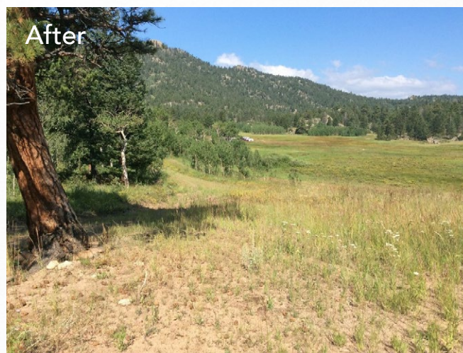
Restoration work at HPOS.