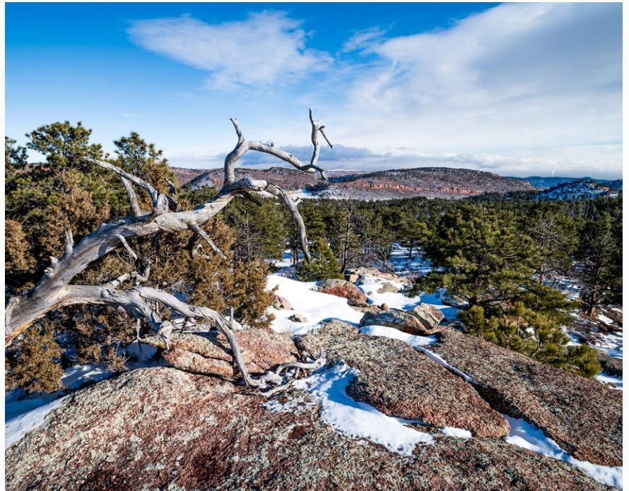
Views at Little Ponderosa Ranch.

LCDNR was honored to receive the 2021 Starburst Award from the Colorado Lottery for the Laramie Foothills Mountains to Plains Expansion Project this past October. Larimer County and the City of Fort Collins conserved two large ranches in the Laramie Foothills, totaling 1,975 acres in 2020, bolstered with grant funds from Great Outdoors Colorado (GOCO). The properties included the Little Ponderosa Ranch and the Hawk Canyon Ranch. These lands provide significant buffers to Red Mountain Open Space, serve as important wildlife migration corridors, and offer spectacular vistas.