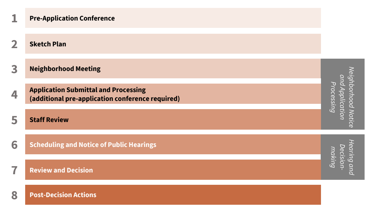
Figure 6-1: Common Review Procedures

This section describes the standard procedures and rules applicable to all development applications unless otherwise stated in this Code. Common review procedures include eight steps, as shown below in Figure 6-1, not all of which are applicable to every development application. Application-specific procedures in §§6.4 through 6.7 identify additional procedures and rules beyond those in this section.