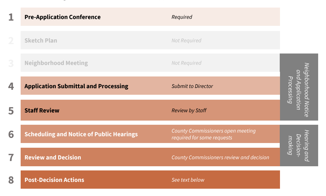
Figure 6-10: Summary of Board-Approved Plat Modification Procedure