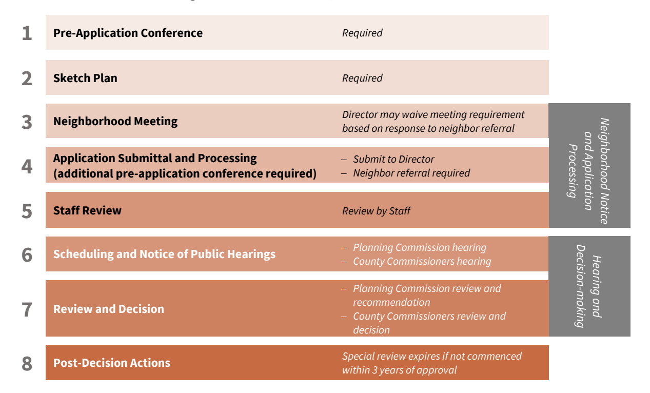
Figure 6-3: Summary of Special Review Procedure